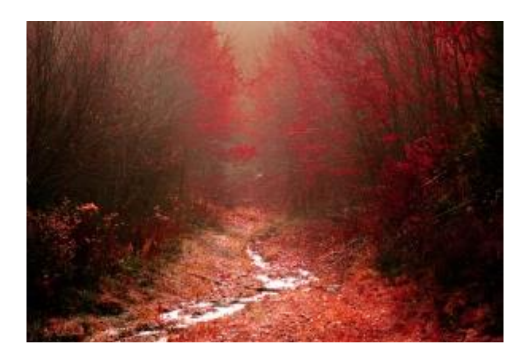
Manifestation Mastermind The Ultimate Guide To Manifesting Effectively

The art of manifestation may be simple for some people. But, when they start their journey to manifest something they desire, they find it hard to make it possible. Get all the info you need here.